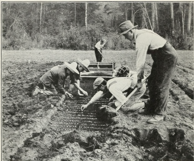
FIG. 1.—PLANTING BULBS WITH A CREW OF FOUR BOYS AND TWO MEN